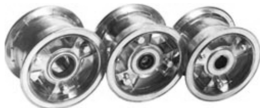
6" Aluminum Wheels are 4" Wide